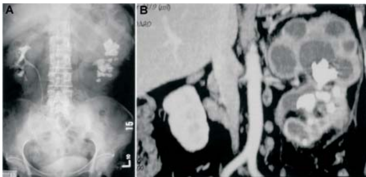
Fig. 2. A 56-year-old woman with history of diabetes mellitus, clinically manifested as fever and left flank pain. (A) IVU shows minimal enhancement of left kidney, with suspicious space occupying mass at upper pole. A staghorn stone of the left kidney is also noted. (B) CT urography shows multiple loculated cysts of the upper pole of the left kidney and staghorn stone within the left renal pelvis. Xanthogranulomatous pyelonephritis was diagnosed by CT urography with subsequently surgical confirmation.

performed in the non-urolithiasis group and correctly diagnosed 23 cases of 24 renal or ureteral tumors (95.8%) (Fig. 3), and 4 cases of congenital disorders (100%) (Figs. 4, 5) (2 duplications, 1 congenital renal agenesis due to VATER syndrome and 1 retrocaval ureter). Twenty-nine of 34 patients (85.3%) with chronic inflammation of GU tract or ureteral stricture were correctly diagnosed by CT urography (Fig. 6). CT urographic findings of the remaining 5 of 34 patients could not be distinguished from neoplasm of urinary tract (Fig. 7). The final diagnosis of malignancy was excluded in these 5 patients only after biopsy or brushing cytology by ureteroscopy.