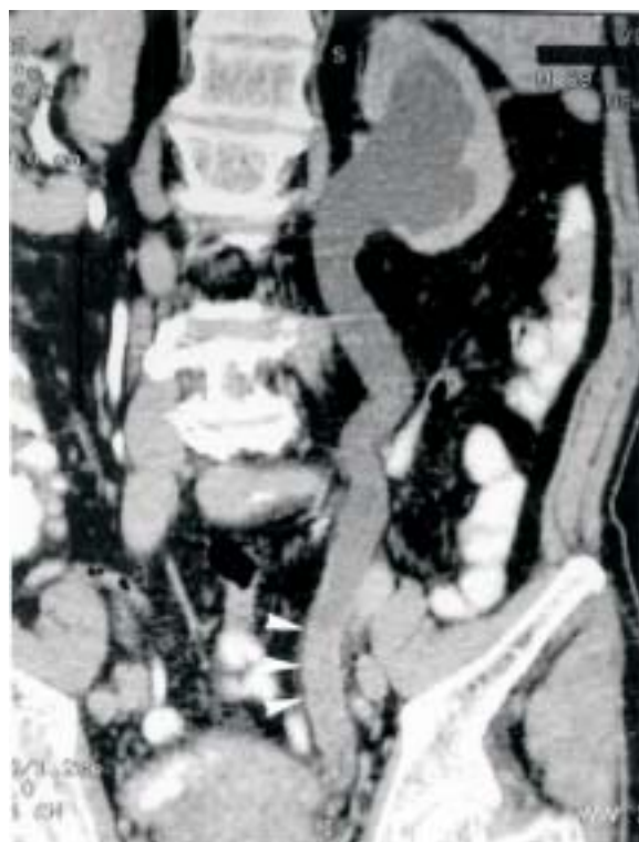
Fig. 3. A 69-year-old man with gross hematuria for 1 month. CT urography shows marked left hydronephrosis and hydroureter. Note increased soft tissue density of the left distal ureter (arrowheads) which causes obstruction uropathy. Urothelial cell tumor of the left distal ureter was impressed, and was proved by surgery.

Because of the good imaging resolution and rapid examination time of helical CT scan, it has become a promising modality for diagnosing urinary tract abnormalities. By improvement of the computer technique, 3D CT urography reformatted from axial thin-cut multi-slice CT imaging is capable of providing more diagnostic information than that by conventional CT. 4 The radiation dose is also markedly reduced by using the design of multiple-detector of helical CT scan. Recent study showed