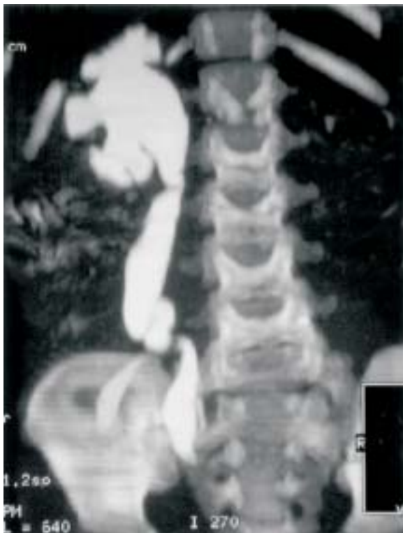
Fig. 5. A 5-year-old boy with a history of congenital heart disease who presented with symptoms of recurrent urinary tract infection. CT urography shows agenesis of the left kidney. Marked right hydronephrosis and hydroureter is also noted. VATER syndrome of this boy was diagnosed.