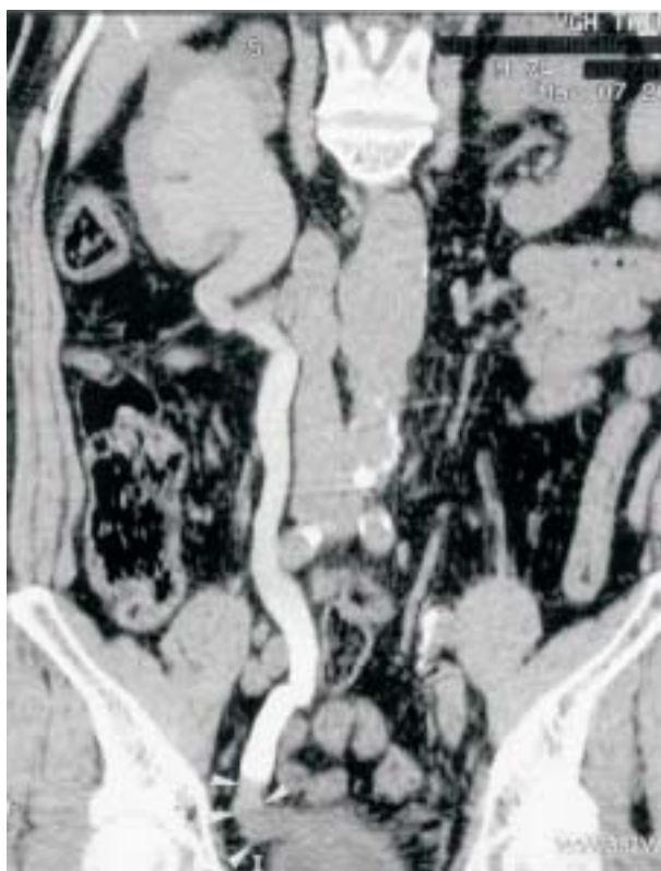
Fig. 7. A 74-year-old man with gross hematuria for 1 week. The CT urography was performed after retrograde pyelography. It shows marked right hydronephrosis and hydroureter caused by soft tissue density (arrowheads) at the right distal ureter. The CT urographic findings suggest right distal ureter neoplasm. However, the result of biopsy showed only some inflammatory cells infiltration.

non-enhanced CT urography as the diagnostic modality for patients with clinical suspicion of urolithiasis, the unwarranted side effects due to IV contrast medium during IVU could also be prevented. Furthermore, it is also beneficial in improving the diagnostic rate of urolithiasis when analyzing radiographs in conjunction with CT scans and CT urography. 4 Although almost all renal stones are radiopaque on CT scan, in extremely rare conditions, they are radiolucent due to variable component of renal stones. 2 In just 1 of our cases, radiolucency of the renal stone with only mild marginal calcification was noted in the renal pelvis; which was falsely interpreted as renal pelvic tumor. Other studies also reported that phleboliths might mimic renal stones at the pelvic region, especially in those patients who lack adipose tissue at the pelvic cavity, which may cause diagnostic pitfalls. 6,7 We did not encounter this situation in our patients, probably