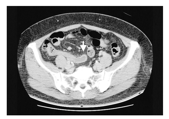
Figure 1. Contrast enhanced computed tomography shows a long swollen appendix measuring about 12 cm in length with wall hyperemia, and with the tip (arrow) pointing towards the presacral region, just across the midline of the lower abdomen.

The patient was initially treated with intravenous fluids and antibiotics and placed under observation. As the LLQ pain with localized rebound and muscle guarding persisted after 4 hours of observation, abdominal computed tomography (CT) with the impression of sigmoid diverticulitis was arranged. The long swollen appendix with wall hyperemia, measuring about 12 cm in length with the tip pointing towards the presacral region, just across the midline of the lower abdomen, was accidentally found (Figure 1). Fortunately, no CT evidence of appendix perforation