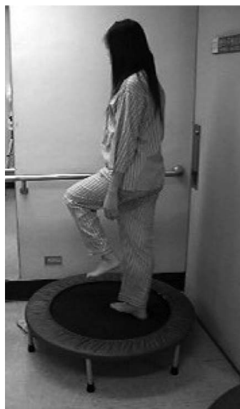
Figure 3. Patient steps on a trampoline as a sensory substitution-promoting exercise and postural strategy practice.

Neck pain is relatively common in whiplash-injured patients. Painful inhibition of muscles results in subsequent limited range of motion. Although the reason for neck pain may be psychiatric somatization, 6 other explanations such as myofascial pain secondary to cervical