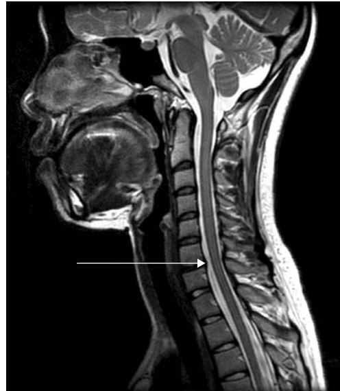
Figure 1. Magnetic resonance imaging of the cervical spine shows only a bulging disc at the C6/7 level with mild spinal stenosis. As the arrow indicates, the black-sigaled space between C6 and C7 is protruding into the white-sigaled spinal canal filling with cerebrospinal fluid.

The vestibular rehabilitation training program was started, with exercises challenging and training her balance function such as sitting on an elastic ball with bouncing (Figure 2), stepping on a trampoline (Figure 3), and standing on a tilting board with movement