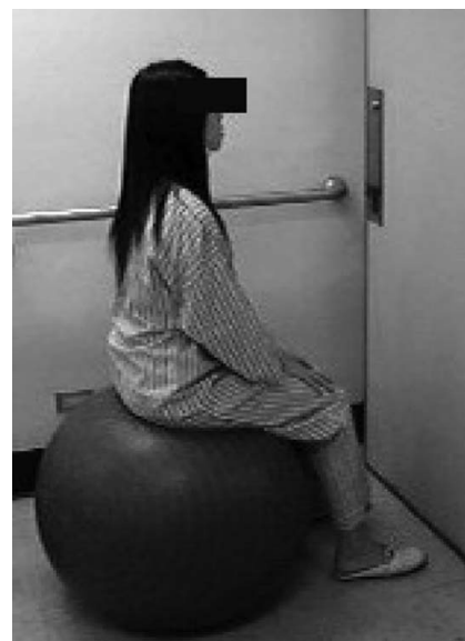
Figure 2. Patient sits on an elastic ball with bouncing as a sensory substitution-promoting exercise and postural strategy practice.