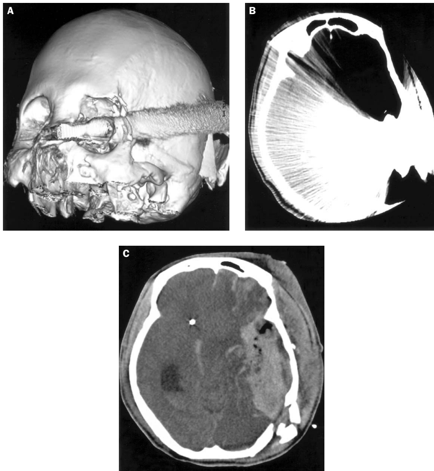
Figure 2. Case 2: (A) 3-dimensional reconstruction computed tomography (CT) shows that the metal bar has gone through the medial canthus of the left orbit and caused ipsilateral occipital bone fracture. (B) CT reveals marked artifacts along the trajectory of penetration and the basal cisterns could not be assessed. (C) Postoperatively, CT reveals large residual (or delayed) hematoma with severe brain shift.