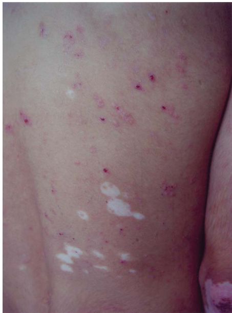
Figure 2. Close-up appearance of the lesions.

overlying epidermis was observed. There were no melanocytes in the basement layer of the epidermis (Figure 3A).