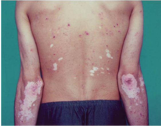
Figure 1. Papulovesicular lesions and vitiliginous plaques on the back.