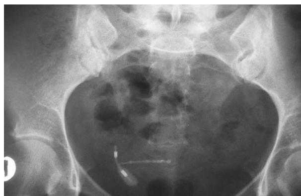
Figure 1. Migrated intrauterine device and stone seen on pelvic plain radiography.

Endoscopic intervention was planned, and the stone formation within the bladder was broken up with mechanical lithotripter. It was observed that the IUD was within the bladder. Grasper forceps were used to grab the embedded portion of the IUD, and the IUD was removed as a whole unit. The urinary catheter was removed on postoperative day 1. No fistula or adhesion formation was observed.