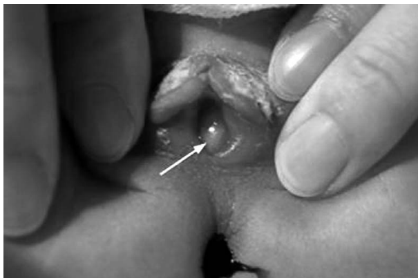
Figure 2. The neonate has a bulging membrane covering the vaginal opening (arrow).

membrane covering the vaginal opening (Figure 2). After detailed examination, the presence of syndromic disorders (e.g. McKusick-Kaufman, Ellis-van Creveld or Bardet-Biedl syndromes), genitourinary (e.g. persistent urogenital sinus) and anorectal (e.g. cloacal dysgenesis)