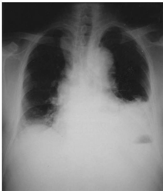
Figure 1. Chest X-ray of Case 1 shows non-homogeneous opacity in the left hemithorax and gas-fluid levels in the stomach.