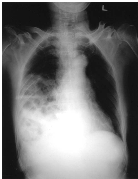
Figure 3. Chest X-ray of Case 2 shows a hyperdense lesion containing bowel gas in the right pleural space.