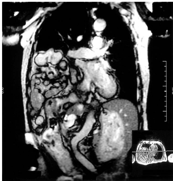
Figure 4. Magnetic resonance imaging of Case 2 shows herniation of small and large bowels in the right thoracic cavity.

diaphragmatic hernia in a newborn baby was reported by McCauley in 1754. Bochdalek hernia was first reported by Victor Alexander Bochdalek in 1848. The Bochdalek hernia is secondary to incomplete development of the pleuroperitoneal folds or improper or absent migration of the diaphragmatic muscle. These canals are normally closed by the pleuroperitoneal membranes in the 8 th week of gestation. Failure to close leads to Bochdalek hernia. The foramen of Bochdalek hernia is usually a 2-cm slit in the diaphragm, just superior to the adrenal gland.