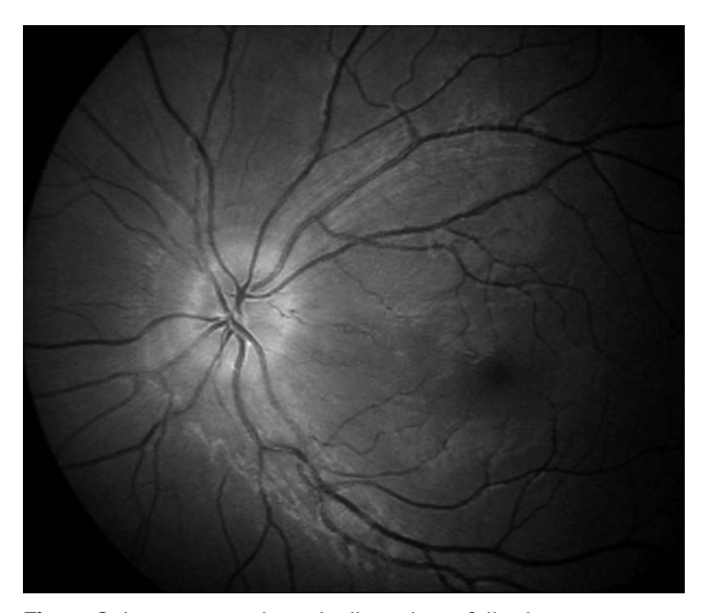
Figure 2. Improvement in optic disc edema following treatment.

A vaccine against hepatitis B virus first became available in the United States in 1982. Hepatitis B vaccination has a key role in the control of hepatitis B. Mass