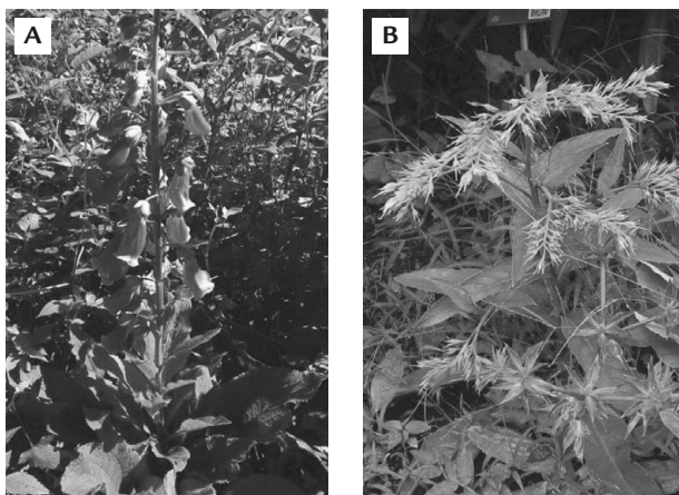
Figure 1. The flowers of (A) foxglove and (B) comfrey are quite different.

Various cardiac glycosides are known to cross-react with commercial serum digoxin immunoassays. We found high serum digoxin concentrations with a range of 4.4–139.5 ng/mL in all of our patients. Accurate digitoxin concentrations might be obtained by employing gas chromatography or high-performance liquid chromatography. 9 However, the equipment for these techniques is not commonly available at the ED. While presenting digoxin-like substances as in the case of