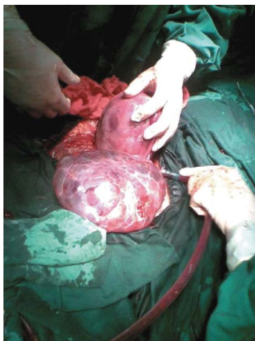
Figure 1. Gross appearance of the left ovary during the operation. An enlarged 12 \times 10 \times 8 cm ovarian cyst was observed. The left ovary was smooth-walled, multiloculated and without solid elements, and replaced by multiple cysts of varying size. The right ovary had already been partially ruptured and it was completely ruptured during the operation.