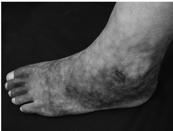
Fig. 1. Reticular and brownish hyperpigmentation around the left ankle and foot with two discrete coin-sized crusted erosions near the ankle and dorsal foot.

EAI has been reported to result from a variety of heat sources. Historically, lesions occurred mostly on the shins of older people who spent much time close to fireplaces or coal stoves. However, such cases are rarely seen today owing to the introduction of modern central heating systems. Nevertheless, EAI is reported sporadically among people who use different kinds of heat sources, such as heating pads, furniture with built-in heating units, heating blankets, car heaters, and laptop computers. 3–8