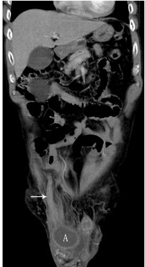
Fig. 2. Coronal reformat contrast-enhanced computed tomography image of the inguinal region showing the path of the swelling appendix (arrow) through the inguinal canal and into the right scrotum, along with perforation and abscess formation (denoted by A). The extent of septic changes was confined within the sac. The diagnosis of Amyand’s hernia with localized scrotal abscess was confirmed.

The most common presentation of Amyand’s hernia is a right inguinal mass that is inflamed and tender, with variable