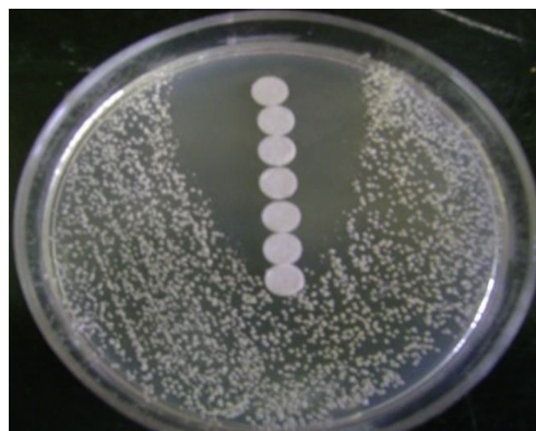
Fig. 2. Antimicrobial activity of Lactobacillus against Clostridium perfringens by modified E test.

It should be mentioned that the inhibitory capability of Lactobacillus metabolites against some vaginal/uterine opportunistic bacteria were also assessed as an ancillary study